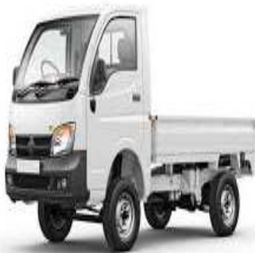
TEMPO CHOTA HATHI