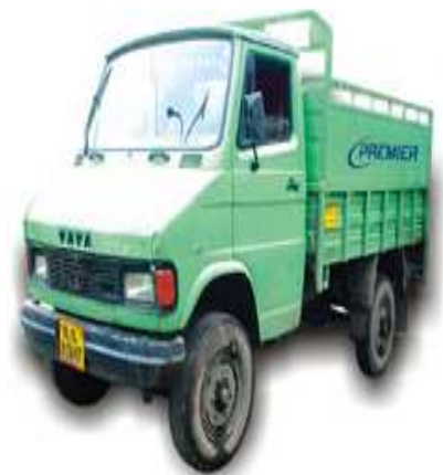
TATA 407 (3.5 MT)