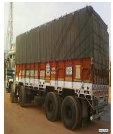
12 WHEELER ( 21 MT )