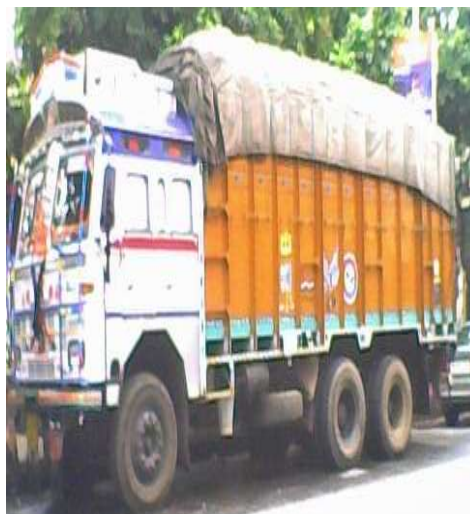
TRUCK 6 WHEELER (9 MT)