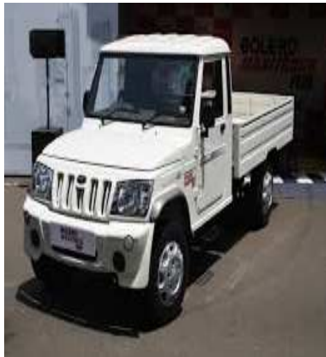
MAHINDRA PICK UP (1 MT)